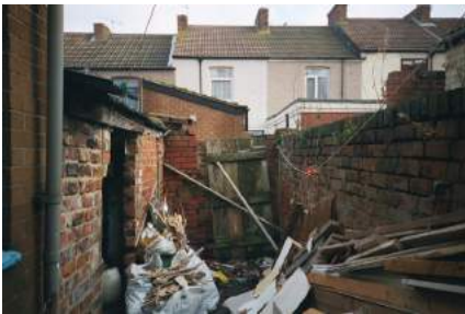
The property in 2000.

This property is a shining example of the Trust achievements and shows just far the Trust has come in 18 years.